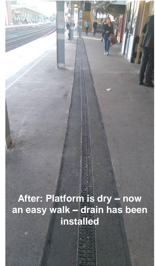
After: Platform is dry – now an easy walk – drain has been installed