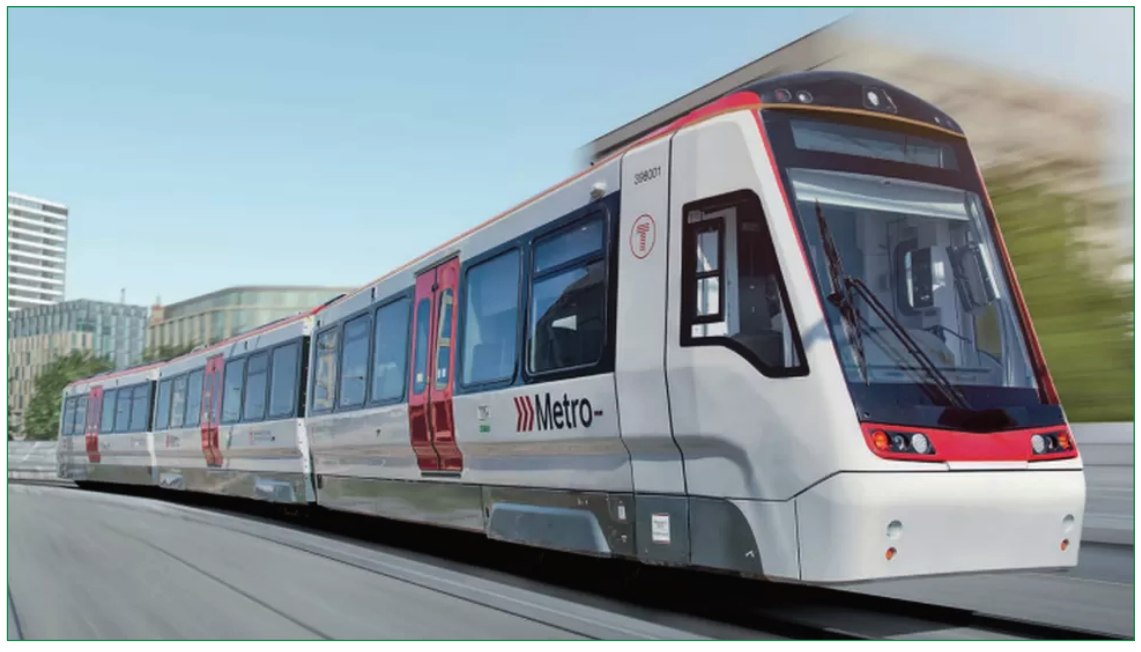
WALES SHOWS THE WAY: Stadler Citylink tram-trains will run on new track between Cardiff Bay and Cardiff Central stations as part of the South Wales Metro

The business case assumes paths would be found through Ely to accommodate the half hourly service. The long-awaited Ely Area Capacity Enhancement could potentially have provided this, but despite the combined authority helping fund the study there are no guarantees that any new paths would be allocated to Wisbech, and the cost of these paths could have a significant impact on Wisbech's benefit to cost ratio.