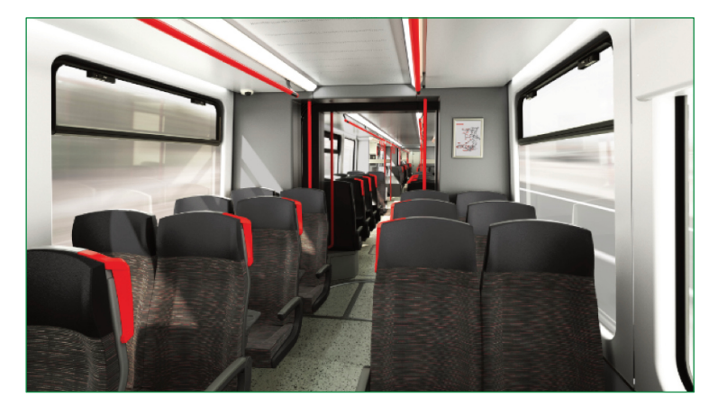
South Wales tram-train interior

of the people of Haverhill and district with 5,000 signatures on a petition calling for the railway to be restored.