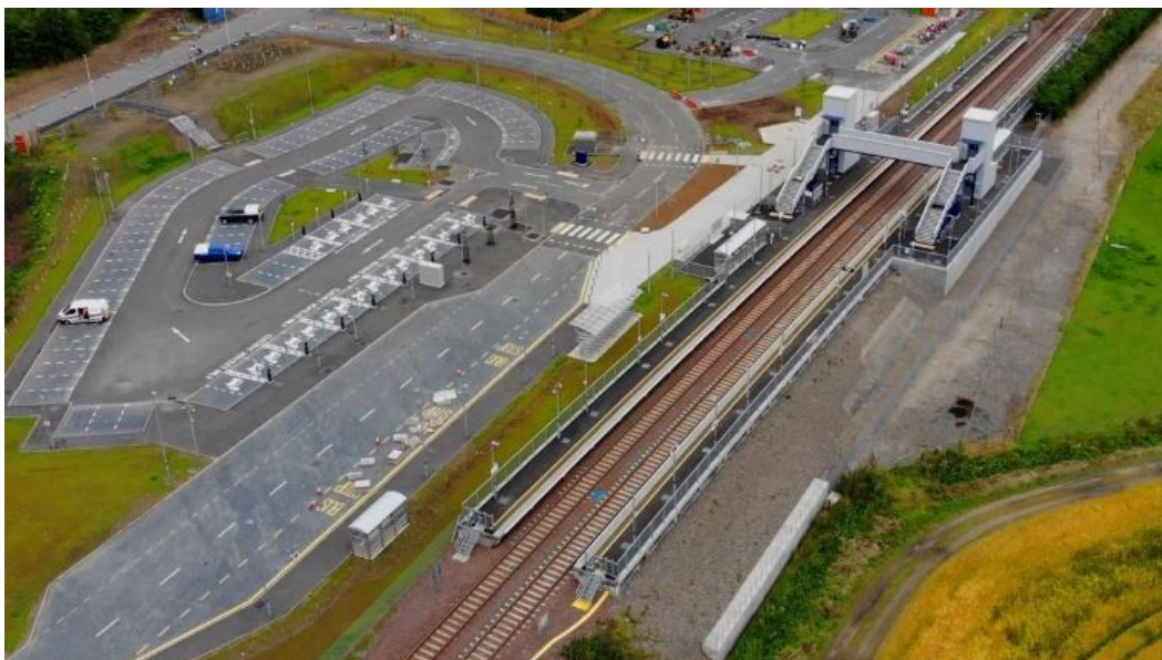
Figure 1: A template for Long Stratton? The new station at Kintore, Aberdeenshire, which opened in October 2020. Provided with good park and ride facilities, the station serves both Kintore itself (population 4,800) and the surrounding district

Norwich in 90 need not be threatened. The station could be served by the additional third train per hour service committed under the most recent franchise without impacting existing services.