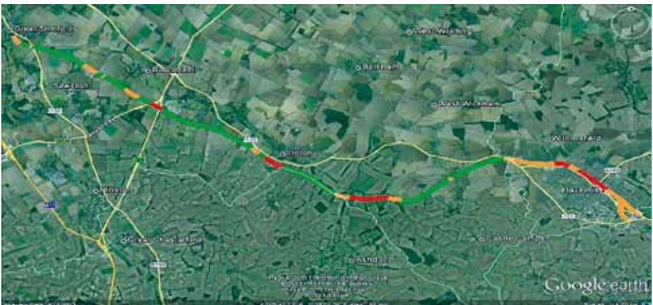
Map from the report colour coded to show the difficulty of reinstating each section of the line