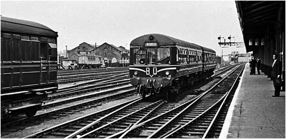
And a reminder of what was and will be again; note train destination. (Cambridge 1960).