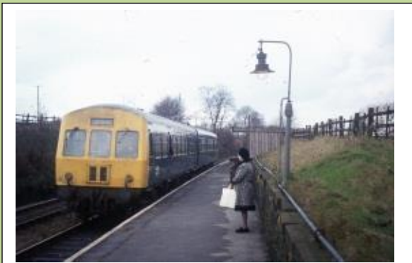
Shepley – midday train to Clayton West in December 1974

This was a torrid time when further closure enquiries in 1981 and 1985 were endured and challenged, but there was sadly the loss of the Clayton West service in January 1983. A fresh start from May 1988 saw a new hourly pattern weekday service and a Sunday service introduced which has produced passenger growth again and now the line needs longer trains to meet demand and a more frequent 30 minute service. The post Beeching period for the line is another story outlined in some recent histories of the Penistone Line.