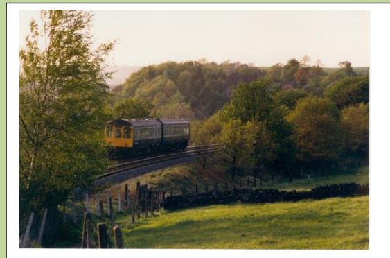
A Calder Valley set at Honley in August 1986