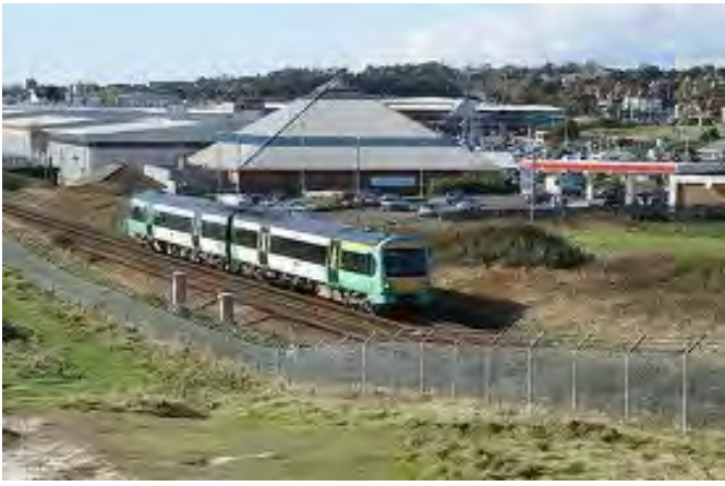
Brighton - Ashford International service at Glyne Gap

Saturday 19 January will be the final date for submission of nominations for the next branch committee and for Motions for April's branch AGM.