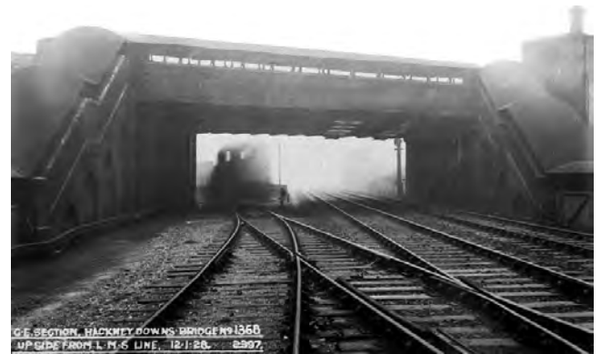
Hackney Interchange, mk1 - 1928

Until 1944 when the North London line passenger service between Broad Street and Poplar was closed, there was a direct pedestrian link between the two stations in central Hackney. The orbital east-west line's station at Hackney Central and the radial north-south line's junction station at Hackney Downs were but a short walk apart, albeit with a change of level in an era before 'step-free' had entered design practice.