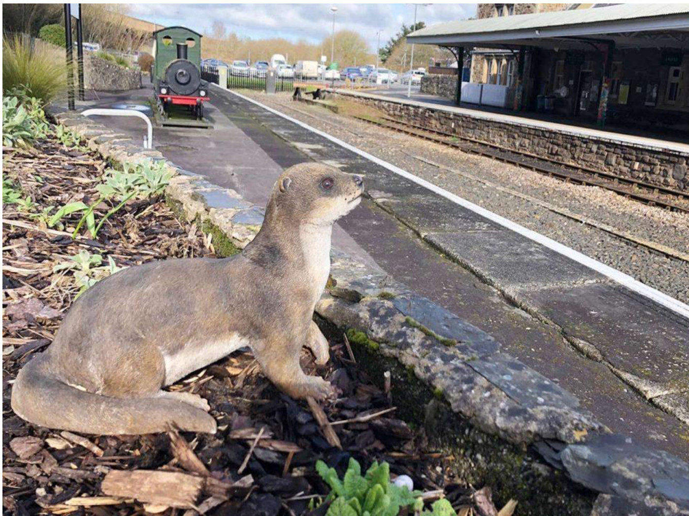
Barnstaple station planters

Friends of Barnstaple Station will be using the grant to design history boards which highlight the station's 170 years.