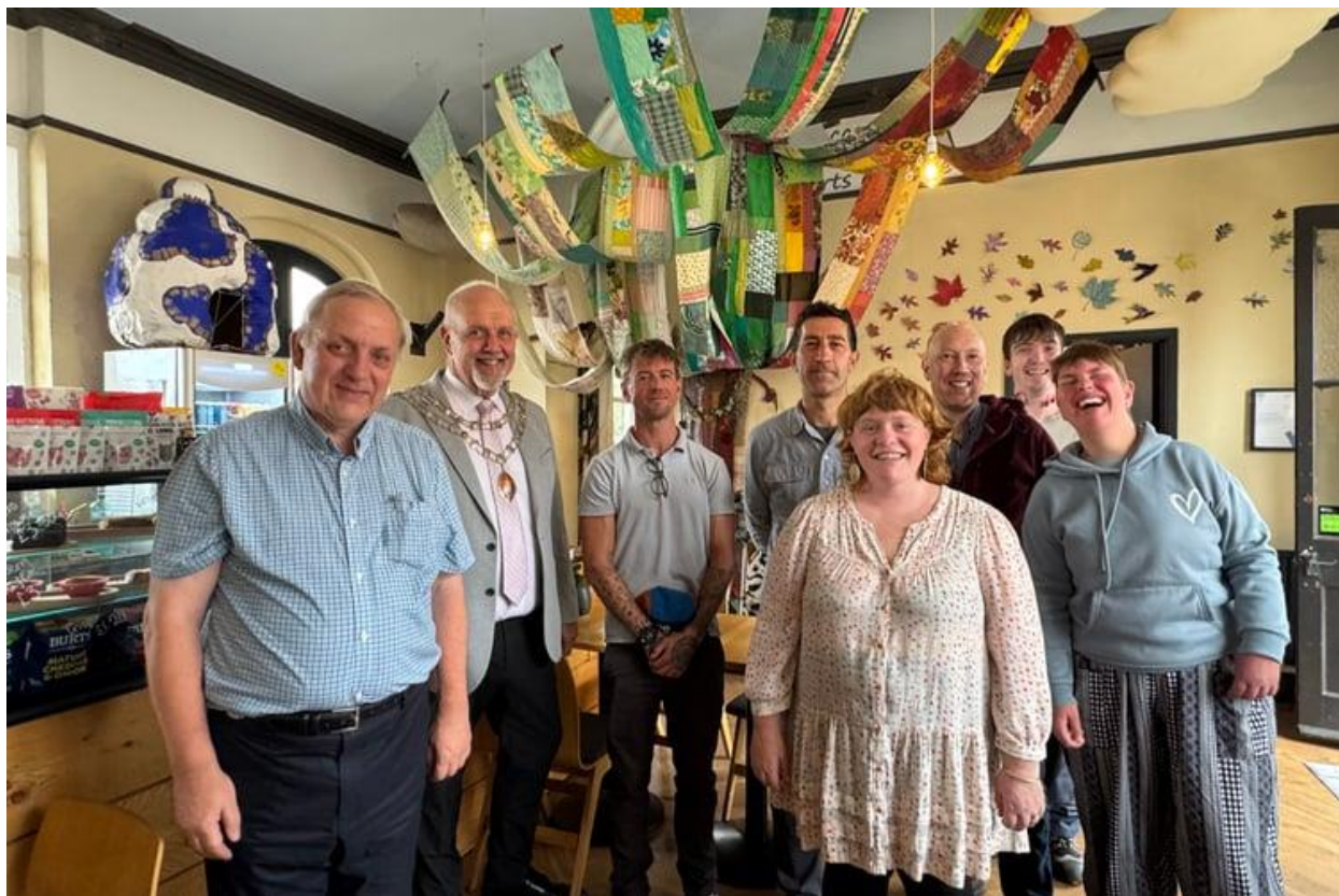
In the Crediton Station Tea Rooms, which is run by The Turning Tides Project, where acoustic management has included sound boards in the form of clouds, art work in the form of a cloth tree, curtains and other furniture.