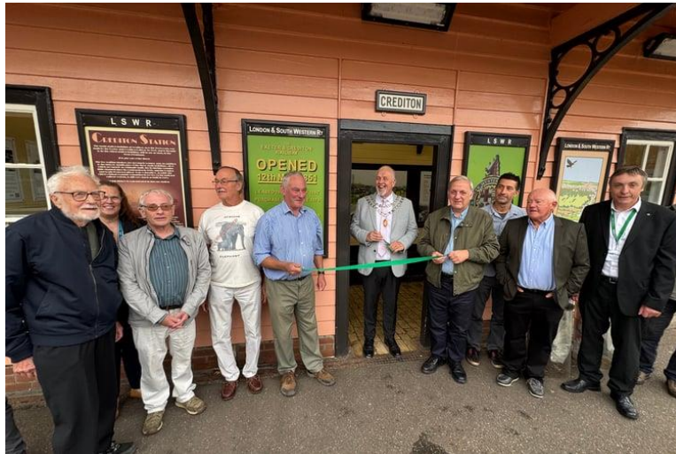
The Mayor of Crediton, centre, about to cut a ribbon to officially reopen the waiting room at Crediton Railway Station which now has historic railway photographs and panels about the history of the railway in the town and area.

The Turning Tides Project looked at the acoustic management of the space and delivered a project that improved the acoustics of the building through a process of community and customer engagement.