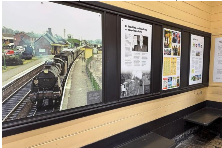
A section of the heritage project in Crediton Railway Station's waiting room.