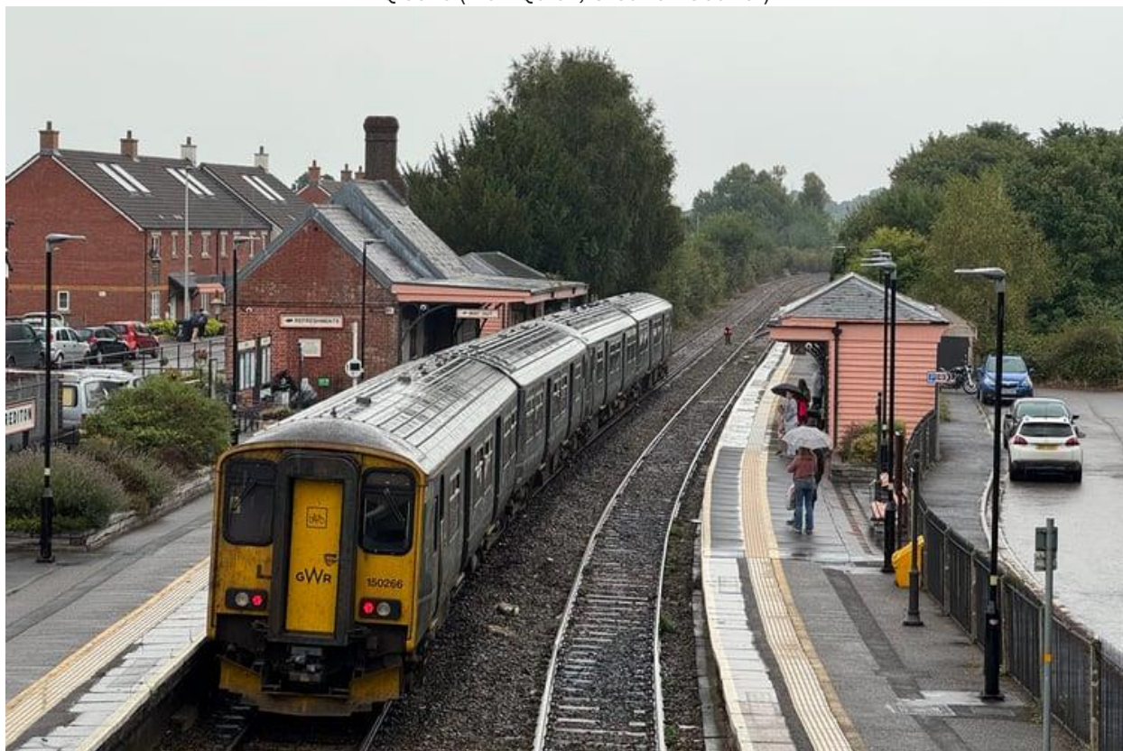
A train en route from Barnstaple to Exeter during the stop at Crediton Railway Station.