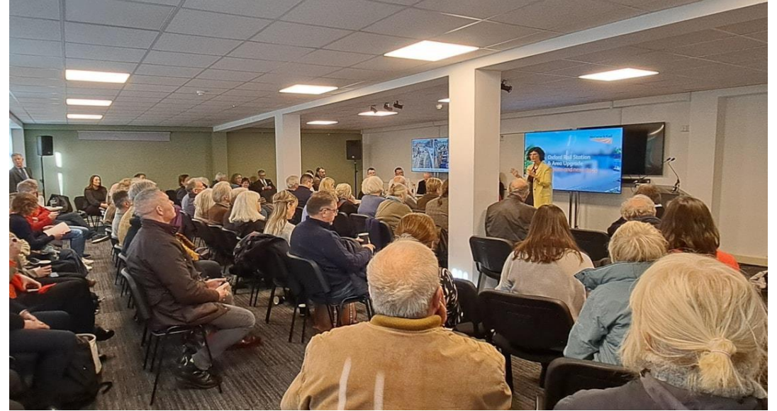
New programme for the expansion of Oxford station announced January 2025