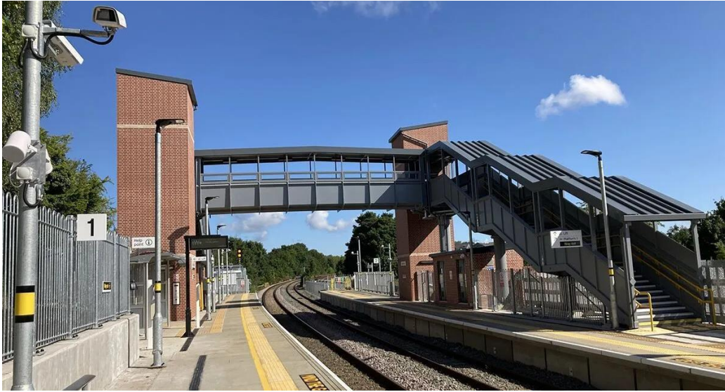
Ashley Down Station opened September 2024