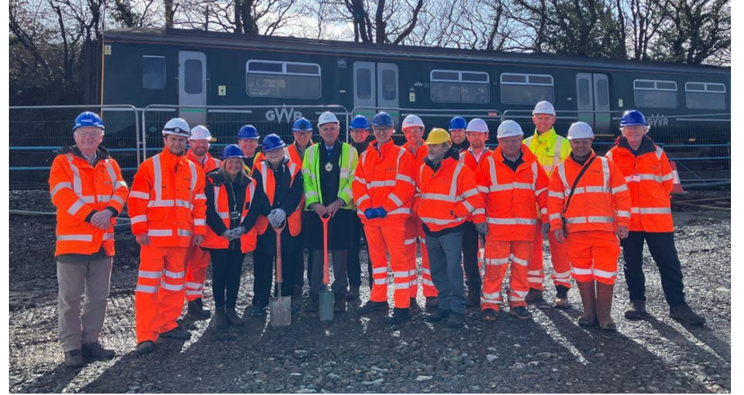
Work starts at Okehampton Interchange in February 2025