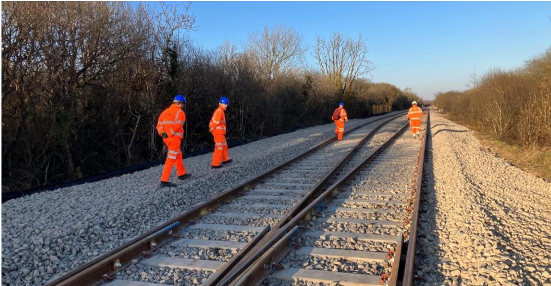
New passing loop at Goss Moor as part of Mid Cornwall Metro