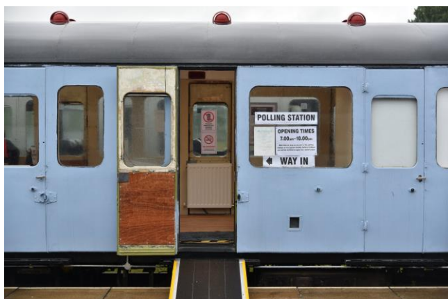
Polling station station in North Yorkshire

Barely had the dust settled after various local elections on 2 nd May (see report on next page) than a UK-wide general election was called for Thursday 4 th July. The new Parliament will first meet on Tuesday 9 th July, with the State Opening expected on Wednesday 17 th July.