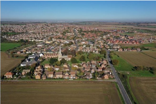
Hoo village - community facilities on the Hoo Peninsula

A Community Infrastructure Framework for the Hoo Peninsula was the focus for public drop-in events in May. They followed the consultation on the draft Neighbourhood Plan for Hoo St. Werburgh and Chattenden, to which we had responded in February. Further details on the Community Infrastructure Framework are in Medway Council's website, here .