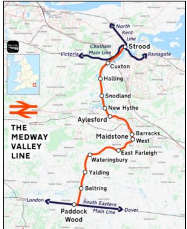
Medway Valley Line Extension – to Hoo St. Werburgh?

One of the shortcomings of the unsuccessful Housing Infrastructure Fund initiative was its limitation in only looking westwards for passenger service destinations, when the economic geography of the area would point more naturally towards the Medway Towns and the county town of Maidstone. A new east-south chord linking Hoo with Higham would be warmly welcomed by the freight operators using the Grain Branch, too.