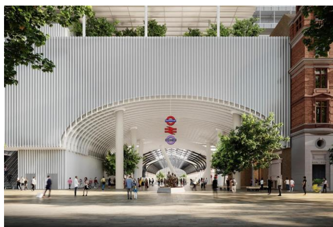
Liverpool Street side, looking north

Britain's third-busiest rail station before the pandemic, it was still the fourth-busiest in 2021/22 despite a halving of ORR-estimated entries and exits, falling from 66 to 32 million. Within-station interchanges declined less, from an estimated 4.4 to 3 million.