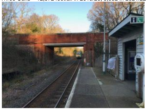
Sunday 21st May 2023: the return of hourly Sunday services for THWART stations