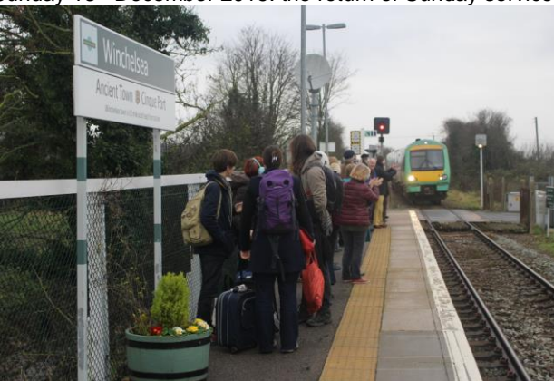
Winchelsea – 9,688 footfall in 2019/20, 9,322 in 2021/22 Three Oaks – 12,672 footfall in 2019/20, 8,952 in 2021/22

Sunday 13th December 2015: the return of Sunday services