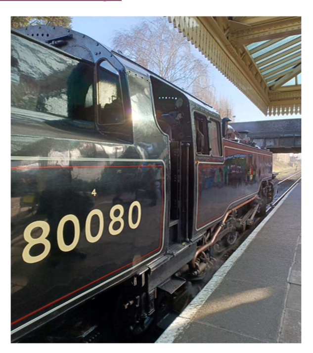
Tidy bit of kit. BR Class 4 Standard 2-6-4 tank locomotive No. 80080 stands at Loughborough Central on 29<sup>th</sup> January, awaiting departure with the 14:30 to Leicester North.

One might not normally think of heritage railways as properly fitting within 'rail future', but I think an exception can be made for the Great Central, especially given its other life as an industry test track. Reconnecting it to the network gives the potential for freight traffic and through excursions to resume.