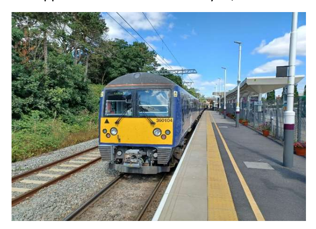
Before. EMR unit 360104 at Corby on 23<sup>rd</sup> August 2021. It is in the former Greater Anglia blue livery.

And a belated welcome to 2022. It will no doubt be a momentous year for the railways, not least as we try again to rebuild after the pandemic. I have decided to use the title East Midlands Update for these newsletters, as this seems more meaningful than simply ' Update '. The fact that the initials are 'EMU' is accidental, but it does give me an excuse to slip in a couple of pictures of an EMU, EMR Connect unit 360104, in its old and new liveries. The pictures do not quite do justice to the way a revised livery scheme, including the different treatment of the yellow on the cab fronts, can transform the appearance of a train. Mind you, the interiors of these units are yet to be refurbished.