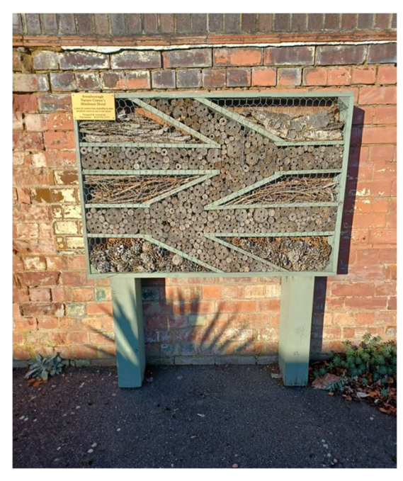
'Minibeast Hotel' in corporate BR (and GBR?) style, Platform 1, Attenborough, on 5<sup>th</sup> January 2022.

You may recall the free-range eggs machine at Oakham in the last Update ? Attenborough station, on the MML on the outskirts of Nottingham, lacks some basic facilities, such as passenger information screens, or car parking of any kind. However, it is lovingly looked after by the charmingly named Attenborough Elderflowers. They maintain planting on the platforms, and there are interesting display boards giving the history of the station and its surroundings. Two of its unusual community-minded amenities are shown below: