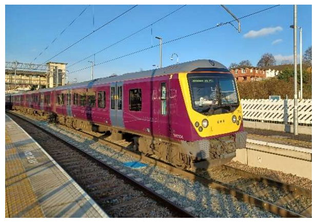
After: 360104 at Kettering on 26^{th} January 2022, now reliveried in EMR style, complete with wrap-around yellow cab front. This gives the unit a much more modern appearance.

OK, having got that out of the way, let's get on with the latest round-up of bits and pieces for Railfuture East Midlands Branch (Rf EM).