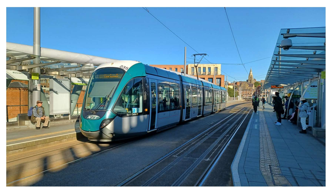
Blue-sky thinking? A Nottingham Express Transit tram calls at Nottingham station on its way from Toton Lane to Phoenix Park on 6<sup>th</sup> November 2021. This route, extended, would be the main connection between the Toton & Chetwynd Strategic Masterplan area and the city centre, as well as providing a transport artery through the major regeneration area.

• Whole Industry Strategic Plan, call for evidence by the Great British Railways Transition Team. This major consultation sought views on the development of Great British Railways and its recommended 30-year strategy 'to determine how best our railways can support the public good of our country in the future'. In preparing its national response, Railfuture sought the views of all Branches, and we contributed to that. The Railfuture response can be viewed at https://www.railfuture.org.uk/display2939