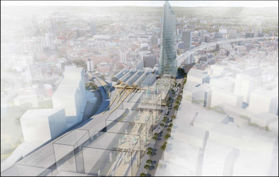
Manchester Piccadilly Underground Station as proposed by Weston Williamson