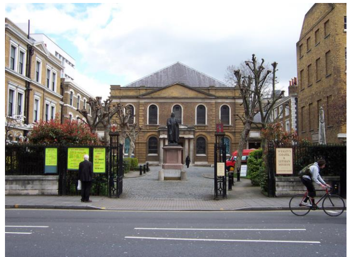
Branch annual meeting venue: Wesley's Chapel, EC1Y 1AU

Before the next edition of inter-railse in May we shall be wending our way to Worthing on Thursday 4 th to work out, provoked by three speakers and with your support, “ How to improve West Coastway rail services ”, and then gather in London on Saturday 27 th for our annual open meeting, with speakers on rail access to airports.