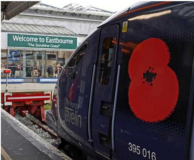
UK Railtours' Regency Javelin, 12 November 2016

The DfT's recent public consultation on the next franchise for South Eastern " Shaping the future " https://www.gov.uk/government/news/south-eastern-franchise-consultation-launched gave the opportunity to formally register the shared ambition for South Eastern High Speed services to extend from Ashford to Rye, Hastings, Bexhill, and quite possibly Eastbourne as the more natural destination and easier turning-point.