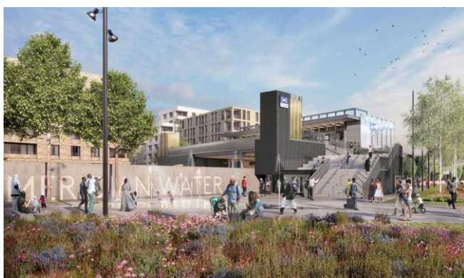
Artist's impression of Meridian Water station – Network Rail

Five years since “ Lea Valley Rail – better access to jobs and homes ” was published by Railfuture, there is now tangible progress with the infrastructure needed to add capacity to the Lea Valley line. Service frequency between Stratford and Tottenham Hale via Lea Bridge will double to 4tph each way, and better serve the new Meridian Water development at Angel Road in Enfield.