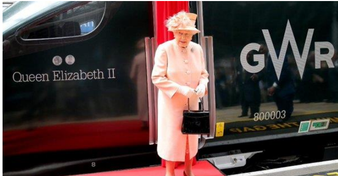
"One's carriage awaits"