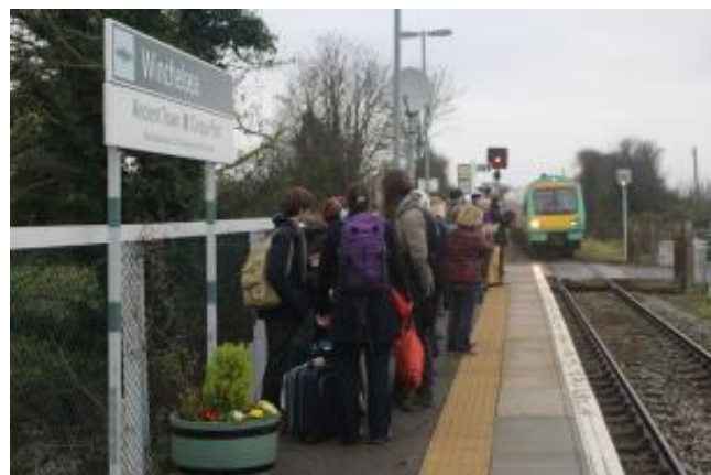
Winchelsea station, 11.42 Sunday 13 December 2015

The December 2015 timetable change marked the successful conclusion of a decade-long campaign by Three Oaks & Winchelsea Action for Rail Transport for the restoration of all-day services on Sundays.