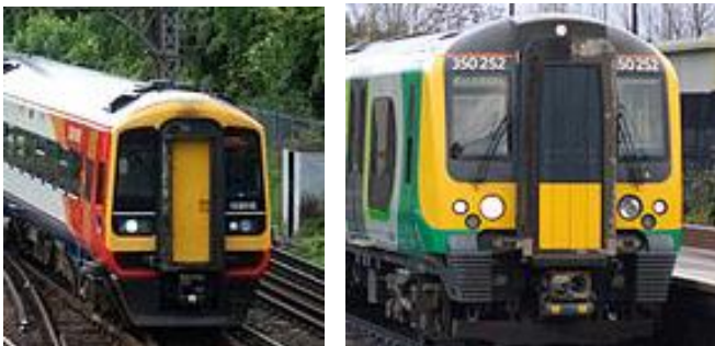
Two of our region's five 'Golden Spanner' 2015 winners

The 'Golden Spanners' awards are based on technical incidents causing trains to be stopped for more than three minutes. High Miles per Technical Incident (MTIN) and low Delay minutes Per Incident (DPI) are the targets. So how did our operators' fleets perform?