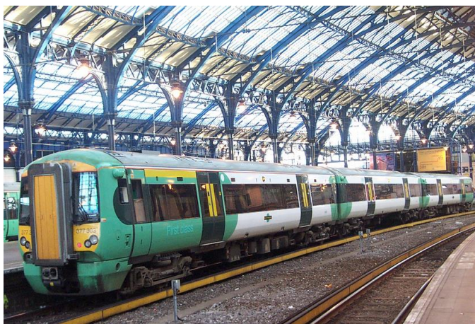
3-car Turbostar at Brighton - future bimode to Ashford?

Similar to but sooner than the 'new franchise' timetable opposite, the schedule for the new 'Integrated Kent' aka South Eastern franchise is due to start this year. The new franchise will run Javelins to Bexhill in CP6. ~ August '16 – Pre-Qualification Questionnaire for train operating bidders ~ November '16 – DfT invites Expressions of Interest (EoI) for the post-Southeastern franchise ~ April '17 – DfT issues Invitation To Tender (ITT) to short-listed bidders ~ February '18 – DfT awards contract for new franchise ~ June '18 – Southeastern franchise (extendable up to six months) due to expire, new franchise due to begin ~ December '18 – latest possible end of Southeastern franchise and start of new franchise.