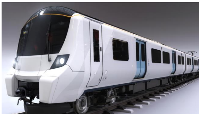
Familiar? 6-car Thameslink variant for Great Northern

Abellio Greater Anglia 81%, up 2%; 21 st =/10 th = c2c 89%, no change; 8 th =/3 rd = Chiltern Railways 91%, no change; 5 th /2 nd Gatwick Express 80%, down 8%; 23 rd /12 th Great Northern 84%, up 3%; 15 th =/8 th = Great Western Railway 84%, up 3%; 15 th =/8 th = Heathrow Connect 89%, up 4%; 8 th =/3 rd = Heathrow Express 95%, up 1%; 2 nd /1 st London Midland 86%, up 3%; 13 th /6 th London Overground 88%, no change; 11 th /5 th South West Trains 81%, up 2%; 21 st =/10 th = Southeastern 75%, up 2%; 25 th /14 th Southern 78%, no change; 24 th /13 th TfL Rail 85%, up 9%; 14 th /7 th Thameslink 73%, no change; 26 th /15 th