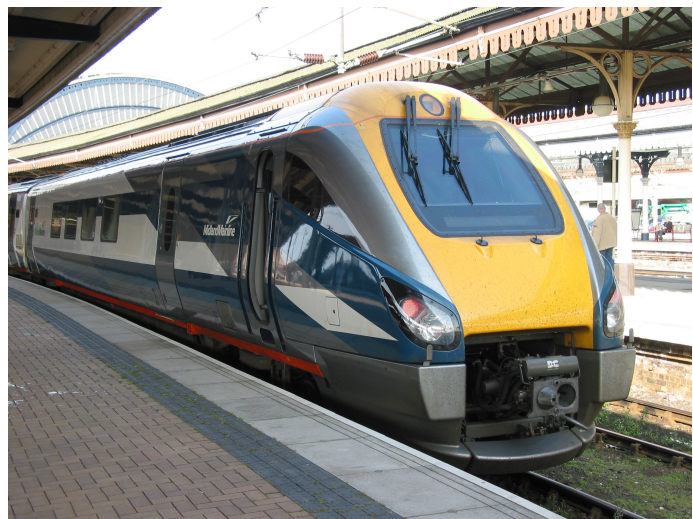
Class 222 Meridian Unit at York

Railfuture calls for an extensive programme of investment to raise rail capacity requiring a mix of infrastructure improvements (including a significant extension of electrification across the region, new and reopened stations and lines), new rolling stock and increased services. Without this, the region will slowly grind to a halt through increasing congestion. Only rail—with its independent routes direct to city centres can meet this challenge.