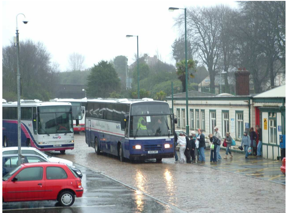
Passengers join rail replacement buses at St Austell on Saturday 22 January during weekend engineering works between Par and Plymouth.

National Rail Enquiries, which is supposed to provide the most up to date information, also had incomplete details. Telephone calls on the Friday before the start of the work, resulted in advice that some trains were running through from Plymouth to Penzance and others would be replaced by buses. When it was pointed out that the line would be closed to all trains, the operator had to admit that the information on the system may be incorrect and suggested passengers should contact the train operator direct or