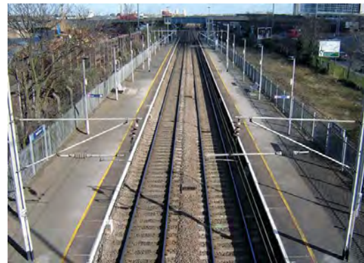
Angel Road station looking north, space for third & fourth Lea Valley tracks on right.

At each stage in the current Periodic Review for the next five-year Control Period from April 2014 the need for a Lea Valley line capacity upgrade has been identified. The transformation on the route in and out of Stratford since withdrawal of the Tottenham Hale shuttle in 1985 is nothing short of astounding. Despite incremental service enhancements in recent years the current basic half-hourly service, even with many trains extended to eight-cars, under-achieves in offering the capacity and quality of service required. The eastwards shift of London's economic centre is reflected clearly in the area of the Tube map now called central London. Stratford as both a destination and an interchange hub is a mark of that shift.