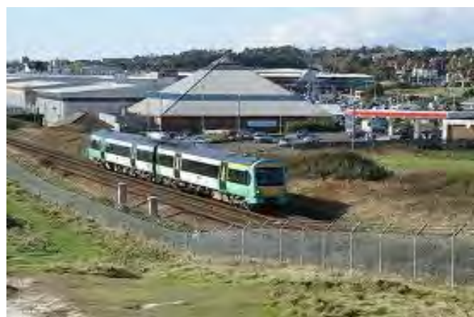
Brighton - Ashford International service at Glyne Gap

Saturday 19 January will be the final date for submission of nominations for the next branch committee and for Motions for April's branch AGM.