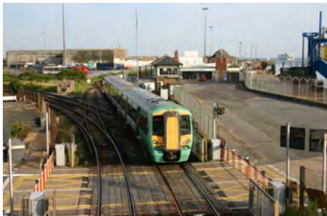
July '08 departure from now-closed Newhaven Marine