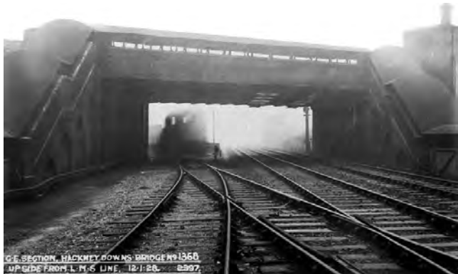
Hackney Interchange, mk1 - 1928

Until 1944 when the North London line passenger service between Broad Street and Poplar was closed, there was a direct pedestrian link between the two stations in central Hackney. The orbital east-west line's station at Hackney Central and the radial north-south line's junction station at Hackney Downs were but a short walk apart, albeit with a change of level in an era before 'step-free' had entered design practice.