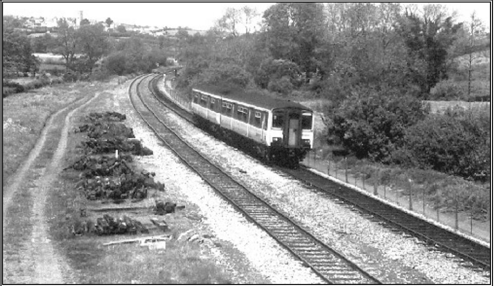
The Exeter to Barnstaple Railway at Yeoford. RDS Vision for a thriving main line.