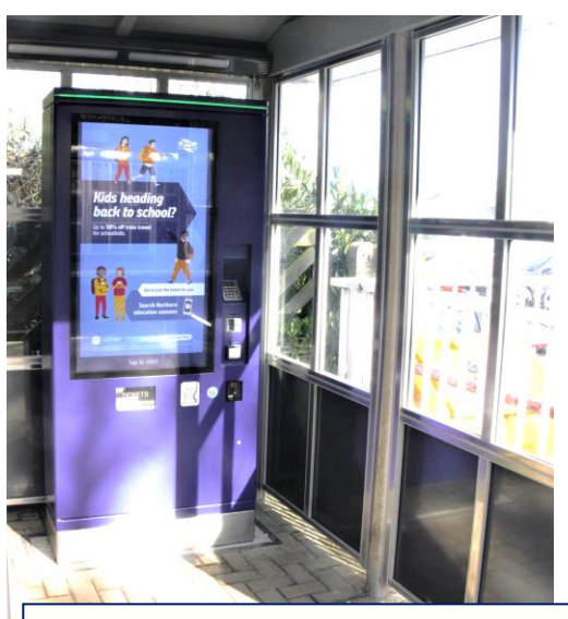
Not easy to use. And on this unstaffed platform you first have to find machine hidden away in a waiting shelter.

Northern plans to order bi-mode – diesel plus battery – trains similar to their CAF diesel and electric trains. The bad news is that, like the existing class 195 and 331 units, these are expected to have only one toilet per two or three car set. Northern have told me that it would take too long to redesign the interiors – yet Transport for Wales's 3-car class 197 trains with similar bodyshells will have two toilets. So I fail to see why Northern cannot simply adopt the same provision. On journeys exceeding 30 or 40 minutes one toilet is not acceptable , given that one may be out of order. This issue has become more important given the increased importance of leisure travel – especially by families with children, and by older people, both of whom tend to use toilets more that commuters. Minimum standards for carriage interiors must laid down – perhaps by safety and standards