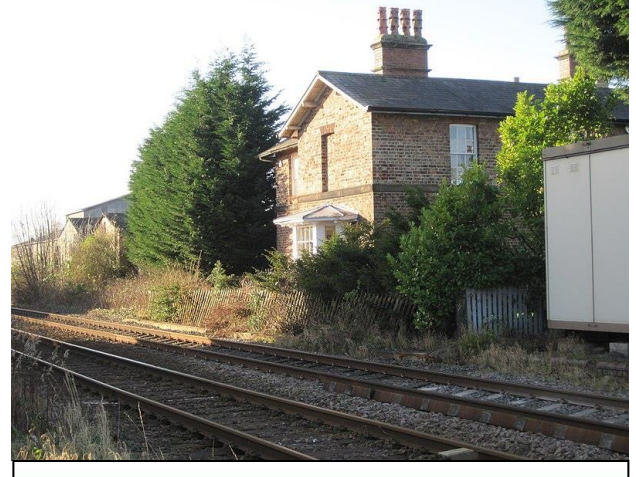
Look out for Haxby former station en route to Scarborough. New one may be some distance away!

York – Scarborough rail service: One of the issues with Haxby is the extra time needed for trains to call at the new