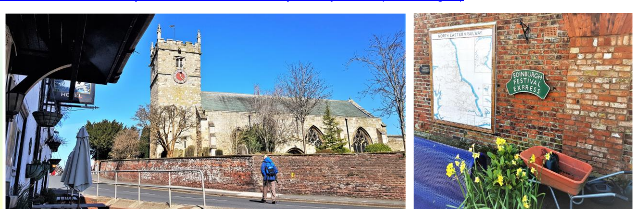
Railfuture: Yorkshire Rail Campaigner 56 – Spring 2022 – page 9