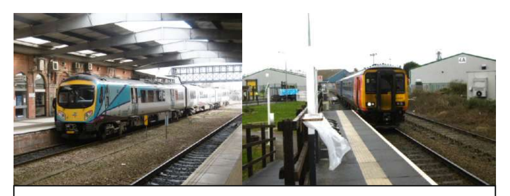
Traction variety in North Lincolnshire: TransPennine Trains Class 197 at Grimsby and a Class 156 at New Holland.