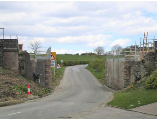
Marsh Gibbon/Poundon Large work site to the left of the former station site (middle right) with new temporary access roads for the east and west approaches. Yet another road underbridge that is being completely replaced. Marsh Gibbon/Poundon bridge abutments awaiting delivery of new bridge deck.