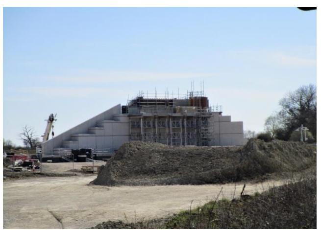
Launton The EWR route runs diagonally from left (west) to right while, in the centre, work continues on building a new overbridge for a realigned Station Road. The existing road is closed until mid 2022. New road overbridge under construction from ground level.