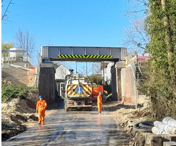
East of Winslow New bridge installed over Little Horwood Road with adjacent works site.