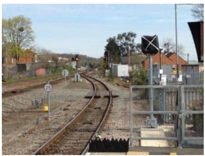
The new repeater signal at the end of platform 1 at High Wycombe has been installed. Unlike the signal at left it can be seen the length of the platform and will allow trains to use the full length thus reducing the long walk (twice as long for those connecting from the up platform). (Nigel Phillips)