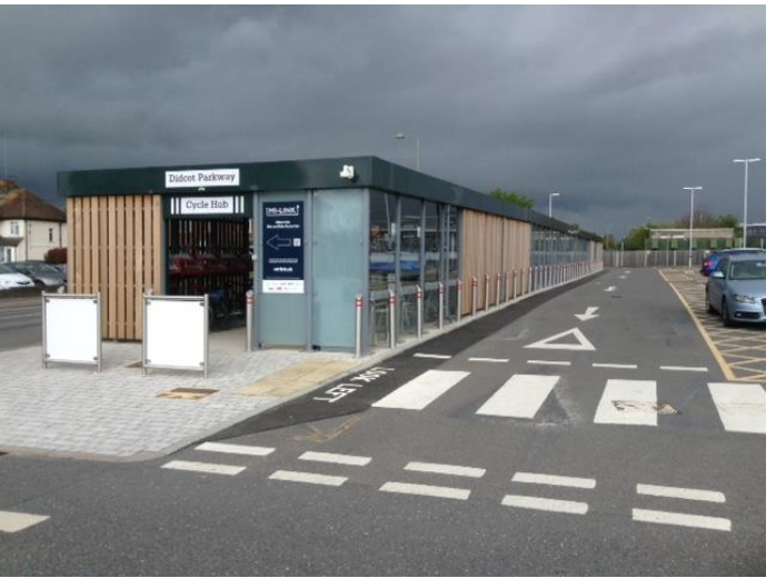
New bike sheds, or cycle hubs as we are supposed to call them, have opened at Newbury and Didcot Parkway Stations, seen here on 5<sup>th</sup> May 2021. New cycle racks have also been installed at Banbury but not in such an impressive structure.