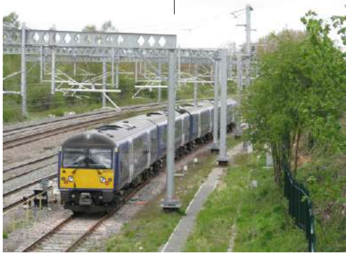
Electric to Corby. Class 360 in Kettering siding on a driver training working.

marked by having a joint publication with Railfuture East Midlands Branch. Geographically our two branches have a lot in common, with local services operated by East Midlands Railway (EMR) and, in many cases, their Regional services link together the two branch areas.