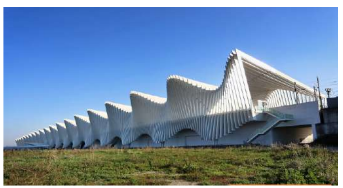
Internet photo of Reggio Emilia Stazione Mediopadana