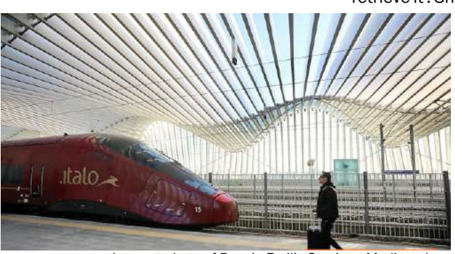
Internet photo of Reggio Emilia Stazione Mediopadana

In October, armed with a four day Europe pass I left Peterborough and took Eurostar to Gare du Nord, then Metro to Gare de Lyons where I caught Milan train. Usually I take sleeper, but these were discontinued because of Covid. As in England, all journeys were with an empty space beside you. My temperature was checked as was my passport en route and I was asked the purpose of my journey and how much money I had. 400 euros satisfied them. I arrived at Milan Garibaldi and had a hotel booked nearby. I left from Garibaldi for Ancona on the east coast the next morning. The train ran under the city and emerged into a forest of railway lines on the south side of the town. We had about five stops including