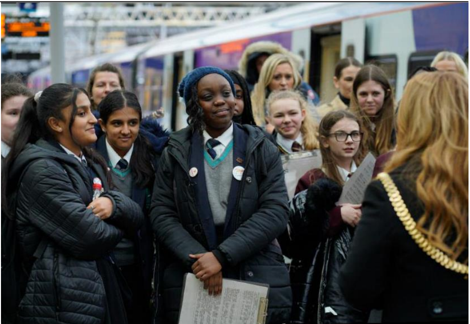
Community Rail Lancashire won the award for Best Community Engagement Project – Women in STEM. Students from a number of Manchester schools, in partnership with the Manchester United Foundation, being met by the Lord Mayor of Liverpool in Liverpool Lime St station.