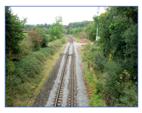
3) The short straight track between the sharp curves at Talaton is the only location for a station to serve Talaton should it ever be required. View towards Feniton. This photo and photo 1 from bridge 496 at 161 miles and 8 chains from Waterloo.

Talaton is about half a mile away and has never had a station. With a population of only around 590 (2012 estimated) the village is rather too small for a station and there is insufficient line capacity to consider one the route until substantially double track .It would only make sense as part of an additional service from Exeter and stopping at a second Cranbrook station running on and to а restored Ottery St. Mary the closed station on Sidmouth line from Feniton.