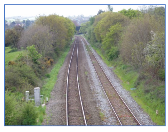
The Torbay Branch viewed south towards Kingskerswell from the Aller Road bridge near the Barn Owl Inn. An Aller Chord would branch westward (to the right) from the double track on a radius of about 240 metres

It could still be built as outlined in the photos, but would be far more expensive than the formerly simple connecting line across open fields.