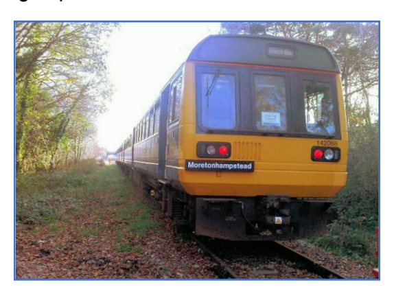
End of the line for now? This special train has just reached the buffer stop to the north of the closed Heathfield station.