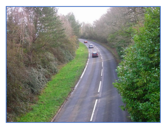
View SE from Ashburton Road, Bovey Tracey along the A382/ former railway. The green strip is wide enough to restore track to a new Brimley Halt on the left.

A plan for a Parry People Mover service between Newton Abbot and Heathfield came to nothing due to the state of the track. Recently much publicity has