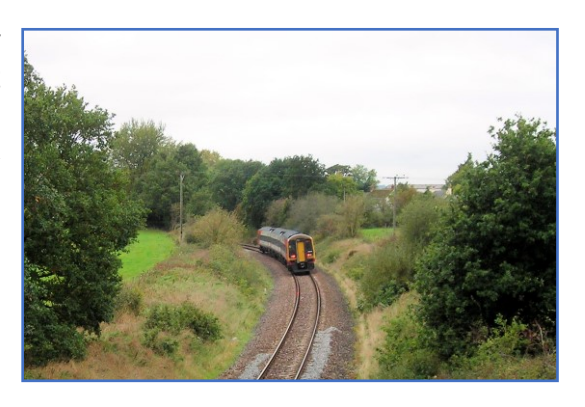
1) The 12:20 Waterloo to Exeter St. Davids on 15<sup>th</sup> October 2018 recedes into the distance as it rounds the sharp curve at Talaton. All the way from Honiton to Pinhoe it was the down line that was retained, but here the track is swinging on to the up formation to ease the curve (on the right).

As the single track starts to curve sharply (radii about 800 m or 40 chains) it swings from one side of the double track width formation to the other so as to ease the curve radii (Photo 1). In addition over the 2¾ miles eastward to Feniton there are 7 overbridges which would need clearance checks, as singled track can get