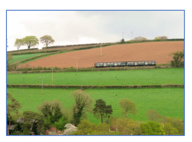
On 26<sup>th</sup> April 2018 the 14:54 Plymouth to Gunnislake descends the 1 in 40 gradient from Bere Alston to Calstock. By train it is a distance of just under 1¾ miles, but by road about 8½ miles.

Previous incidents at Okeltor were on 26<sup>th</sup> June 1997, then a collision with a van on 8<sup>th</sup> December 2005 and with a car the following January.