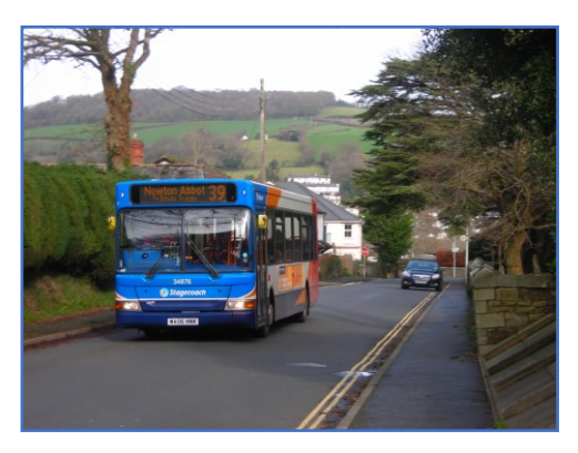
Ashburton Road links the site of the former Brimley Halt to Bovey town centre. The 39 bus runs every 30 minutes to Newton Abbot, but not the station. Photo 9<sup>th</sup> February 2019.

Even with a 40 mph line speed the journey time from