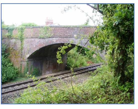
2) Bridge 499 between Talaton & Whimple shows how the arch design may restrict clearances for double track restoration.