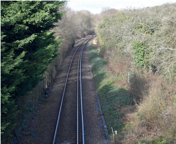
The single track Fareham to Botley railway line looking North from Funtley Road bridge just South of Welborne

By switching many journeys from car to train the station would take many cars off the road and prevent road traffic congestion.