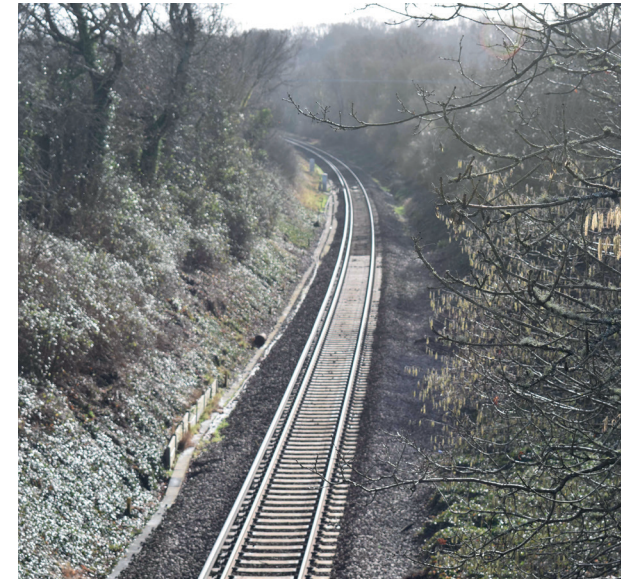
The single track Fareham to Botley railway line looking South from the footbridge just North of Welborne

Welborne Station could be served by the hourly each way train Portsmouth-Fareham-Eastleigh-Winchester-Basingstoke-Waterloo (half hourly at peak times) enabling fast journeys to and from Portsmouth, Eastleigh, Winchester and Southampton (change at Fareham or Eastleigh). Hedge End Station, opened in 1990 and served by these trains, is used by over 500,000 passengers a year with frequent journeys to Eastleigh and Winchester for education and employment.