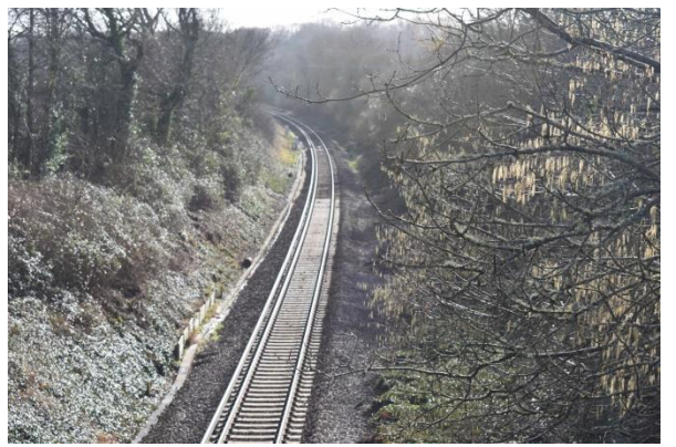
The single track Fareham to Botley railway line looking South from the footbridge just North of Welborne