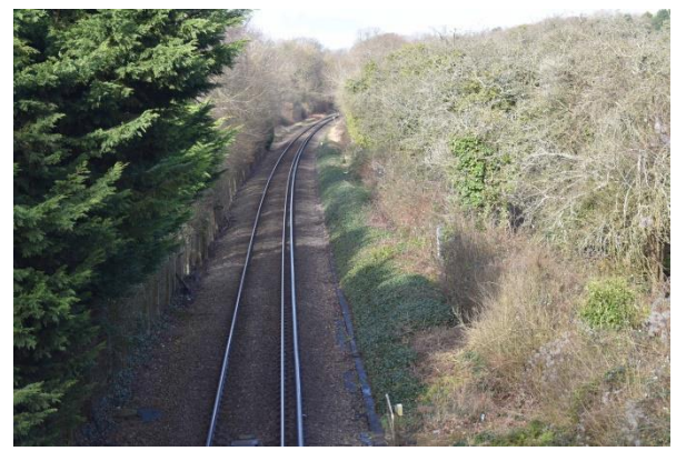
The single track Fareham to Botley railway line looking North from Funtley Road bridge just South of Welborne

By switching many journeys from car to train the station would take many cars off the road and prevent road traffic congestion.