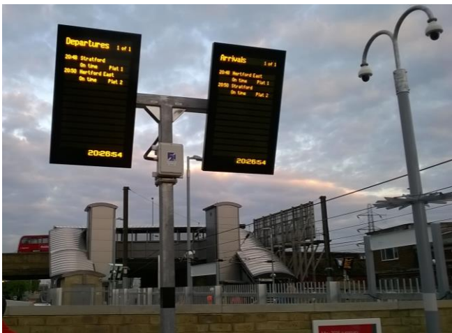
Lea Bridge and first day services, Sunday 15 May 2016

This £12million project has been open to passengers since mid-May, as previously reported in railse no.132. Transport for London demand forecasts used to establish the business case to support reopening the station originally projected about 350,000 passengers per annum by 2031 with a half-hourly train service. After just 10 weeks patronage was already running at about 250,000 ppa! When new East Anglia franchise operator Abellio doubles the frequency to quarter-hourly from 2018, patronage can be expected to triple!