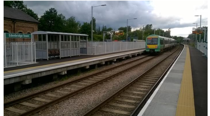
Edenbridge Town platforms looking north 20 June 2016

Extending Uckfield's track south towards Sussex coast for capacity, connectivity and resilience – to be done!