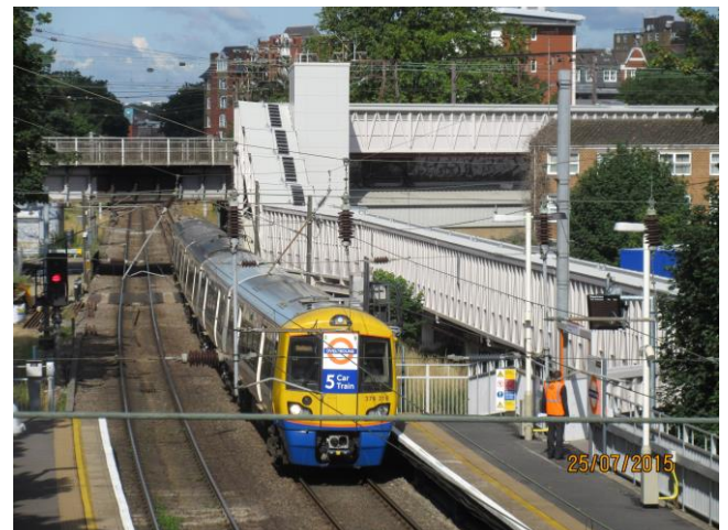
Stratford-bound train at Hackney Central, with step-free walkway to Hackney Downs station out of view up right

This £5million project has been open to passengers since July last year. It enables London Overground travellers to transfer, step-free, between the orbital and radial services in north-east London shortening journey times and avoiding Zone 1. Last reported in railse nos.130 for December and 129 for September 2015, its usage has been closely monitored by Transport for London to compare with its very positive business case which enabled Network Rail to put in £3million, with £1million each coming from TfL and Hackney Council.