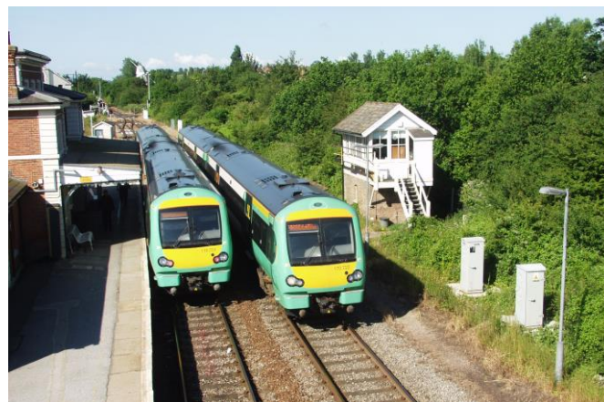
Rye station passing loop, to be extended either west towards Winchelsea or east to Appledore for HS1 trains.

Short-listed bidders for the new South Eastern franchise will not only compete to offer the best 'fit' with the performance specification, which will include HS1 compatibility and 90mph capability across MarshLink; they may now have more of a choice of train to deliver it. As well as Hitachi, Stadler offer bi-mode trains too!