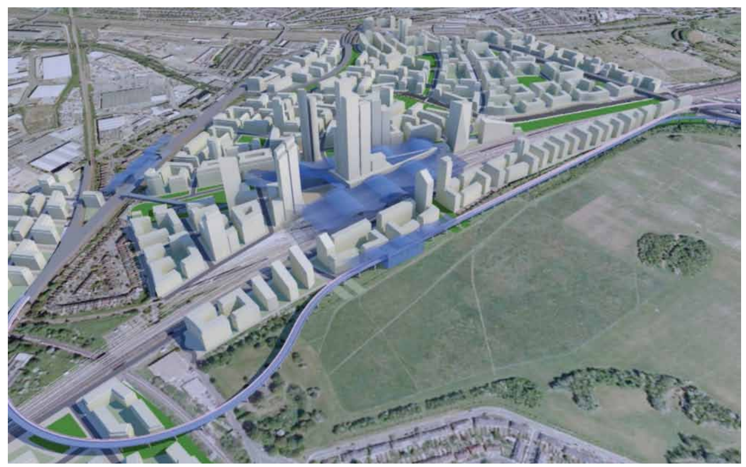
This is an artist's impression of the new city that could grow up in west London thanks to Crossrail and High Speed Two, as it might look in 2043 Picture Greater London Authority (Old Oak: A Vision for the Future)

The creation of a new station at Old Oak Common to serve Crossrail, High Speed Two and the Overground could become the Canary Wharf of West London, it is predicted. The London Borough of Hammersmith & Fulham first asked architects Terry Farrell and Partners to create a vision for regeneration. The benefits and costs of the station will be shared between HS2, Network Rail, Transport for London, Crossrail, train operators on the Great Western and West Coast main line, the freight operators and the Department for Transport. The Old Oak Common super hub is expected to lead to 19,000 new homes and 90,000 new jobs.