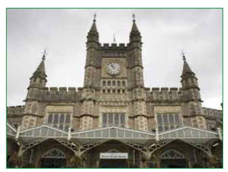
Isambard Kingdom Brunel's Bristol Temple Meads station