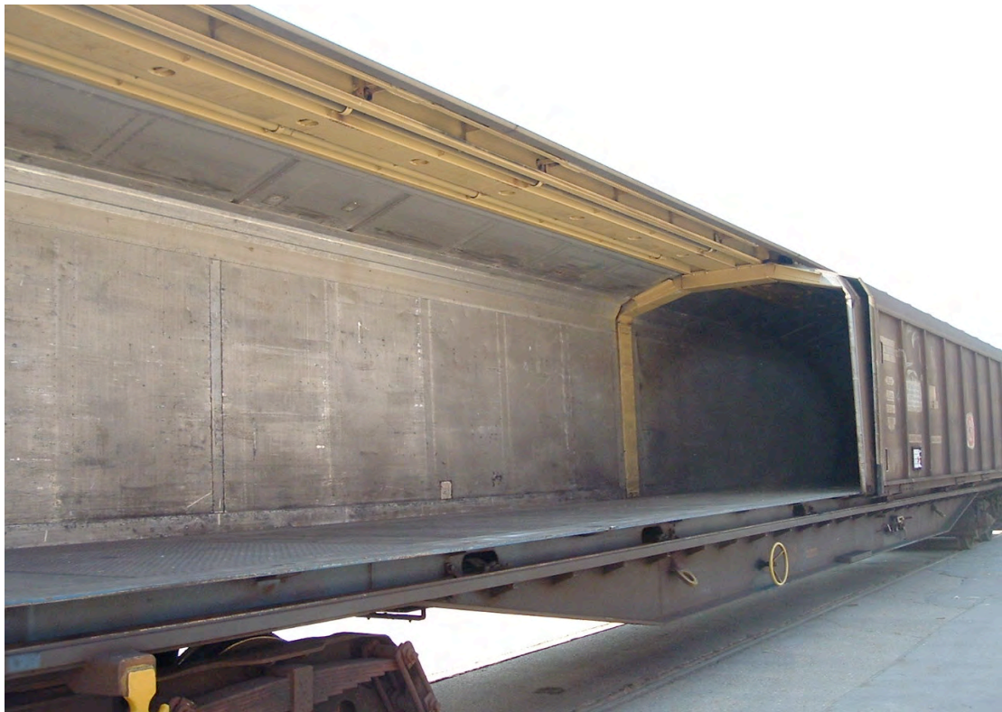
Illustration: Conventional railway wagon.