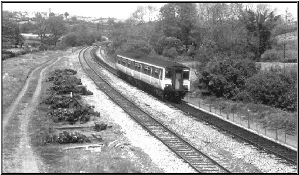
The Exeter to Barnstaple Railway at Yeoford. RDS Vision for a thriving main line.

THIS ISSUE RDS South West Branch Report of the 1999 AGM Autumn Meeting The Eclipse Bugle Station Gets Facelift at Last on 16/10/99 in Truro Freight Future? SW Trains New North Devon Fares Objection to the Barnstaple Western Bypass Planning Application Project Inform's Teething Troubles Motorail Returns - At a Price Summer 1999 Timetable Analysis Letter to Mr. Prescott Virgin's New Trains But Cuts on the Cards in Cornwall? Shadow SRA Questionnaire on Future Service Levels Condemned Network Management Statement Promises Little for the Westcountry Objective 1 Plans Exeter Local Plan First Review Teignbridge Local Plan Issues Report South West Rail Strategy