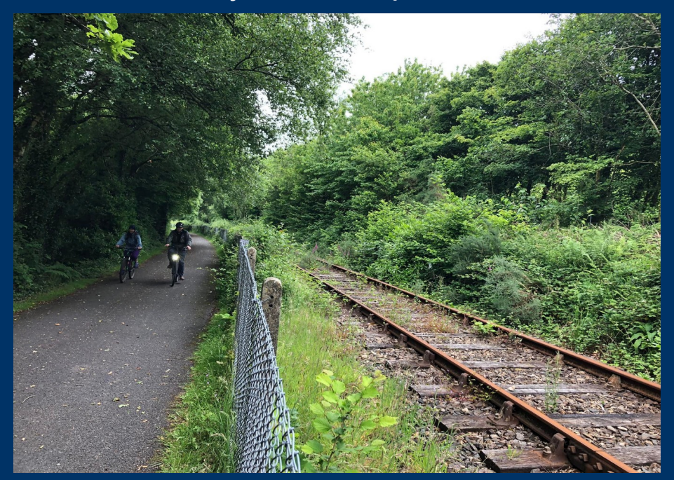
Exe Trail, Exmouth