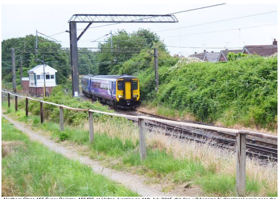
Northern Class 156 Super Sprinter, 156429, at Halton Junction on 11th July 2015, this line will become bi-directional again once the project is complete.