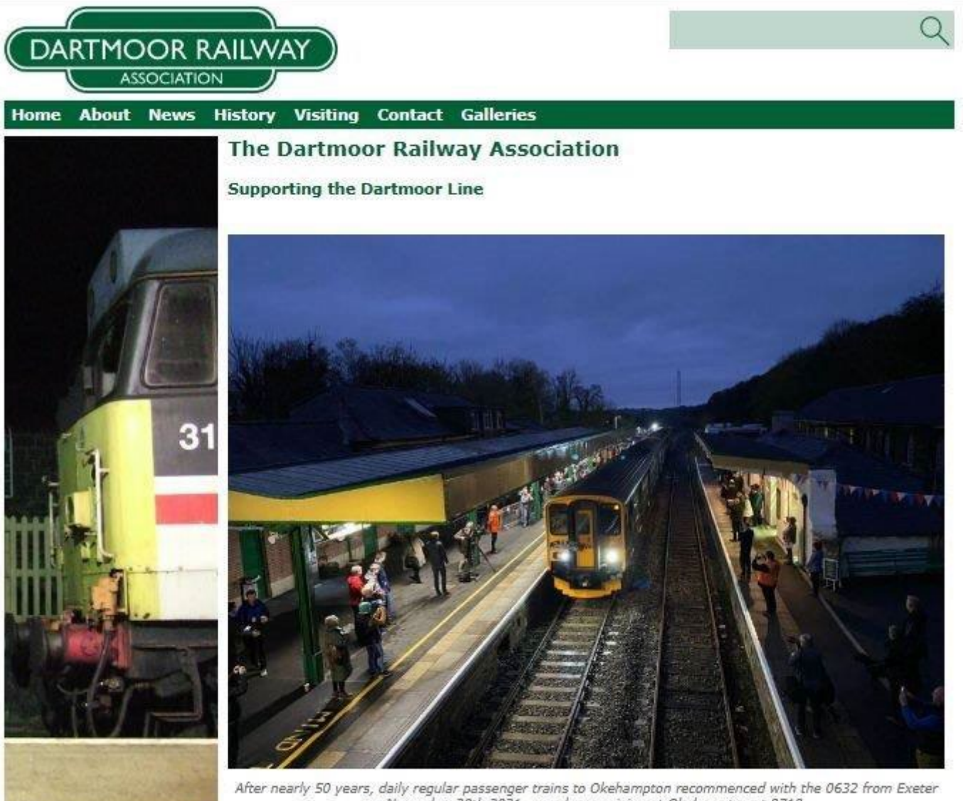
After nearly 50 years, daily regular passenger trains to Okehampton recommenced with the 0632 from Exeter on November 20th 2021, seen here arriving at Okehampton at 0710.