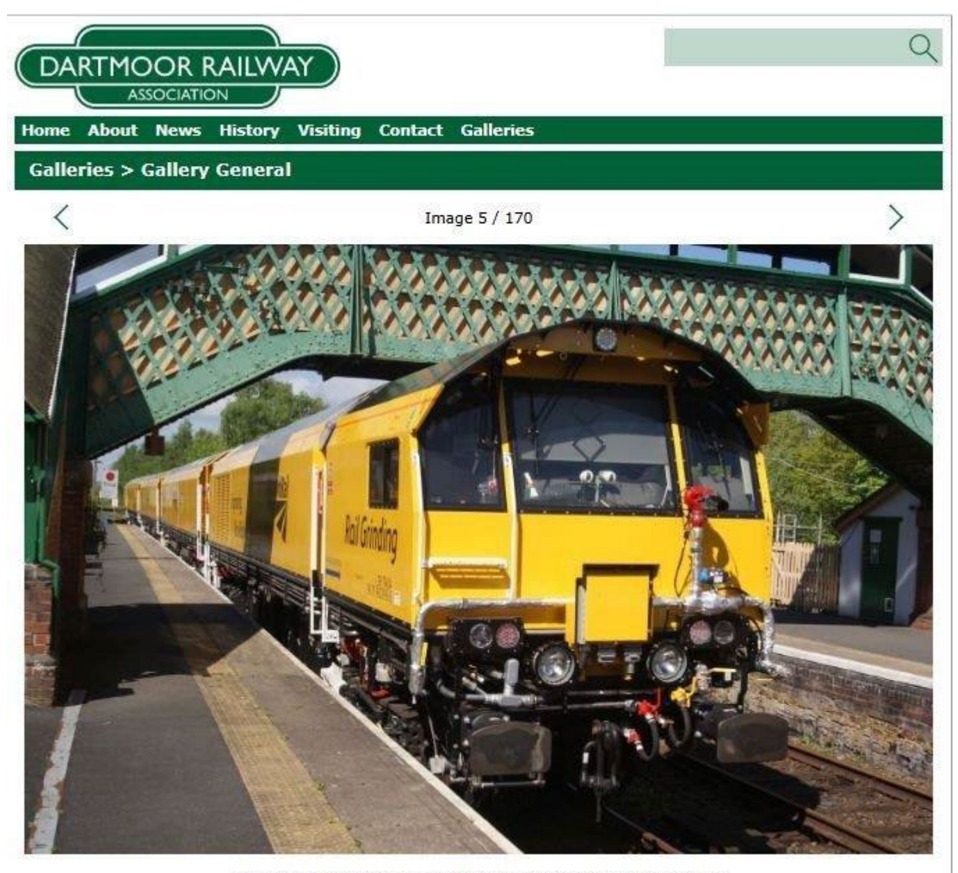
Rail grinder in Okehampton Platform 2, pending departure