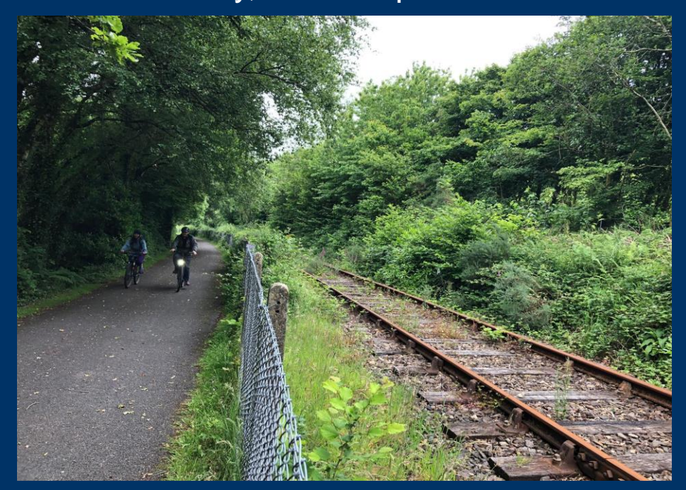
Granite Way, Okehampton