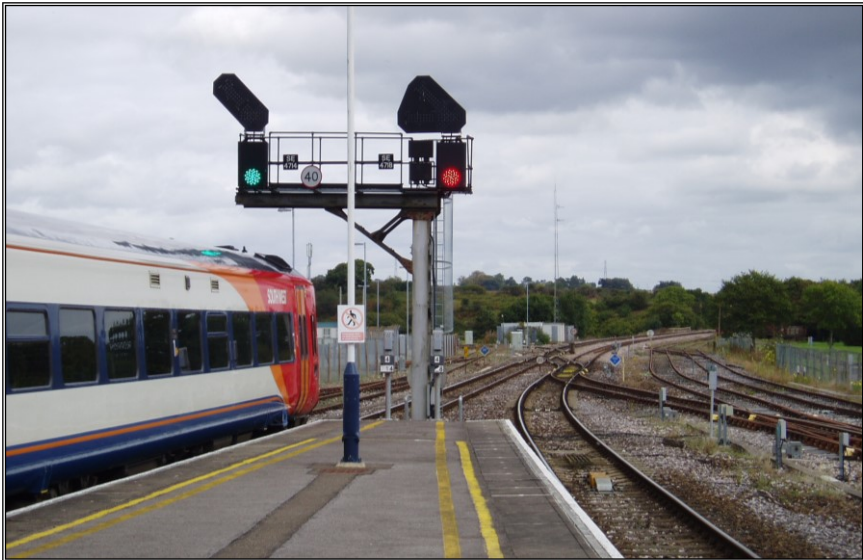
A South West Trains service departs Yeovil Junction for Waterloo on 1 st October 2014. Railfuture would like to see regular services taking the left hand divergence to Yeovil Pen Mill.

A key Railfuture policy is to restore rail services between the two lines. To achieve this we support Devon County Council's aspirations for a half-hourly Exeter to Axminster service, but extended through to Yeovil Junction and Pen Mill stations. This would connect with the Weymouth and Dorchester to Bristol line, a route which has outline plans for an hourly service. When needed, Penzance to Paddington trains would take over the new Exeter to Yeovil paths, but continue to serve the intermediate stations on their way back to the normal route at Castle Cary. The new service would need additional passing loops for example in the Crewkerne area.